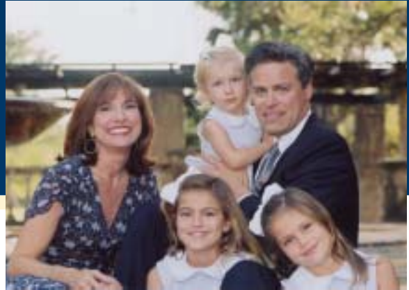
Married to Marilyn Milián Judge of "People's Court" TV Show